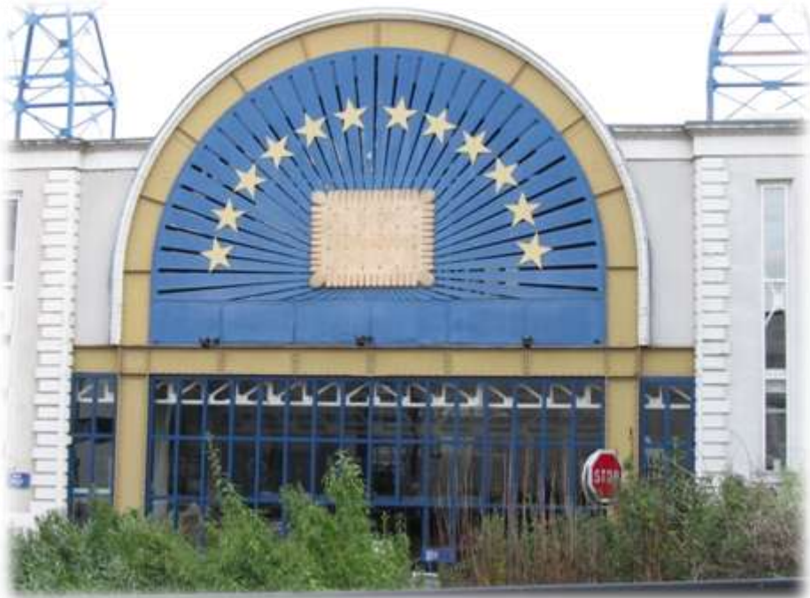
The famous « LU » biscuit baker and its original factory built in 1885