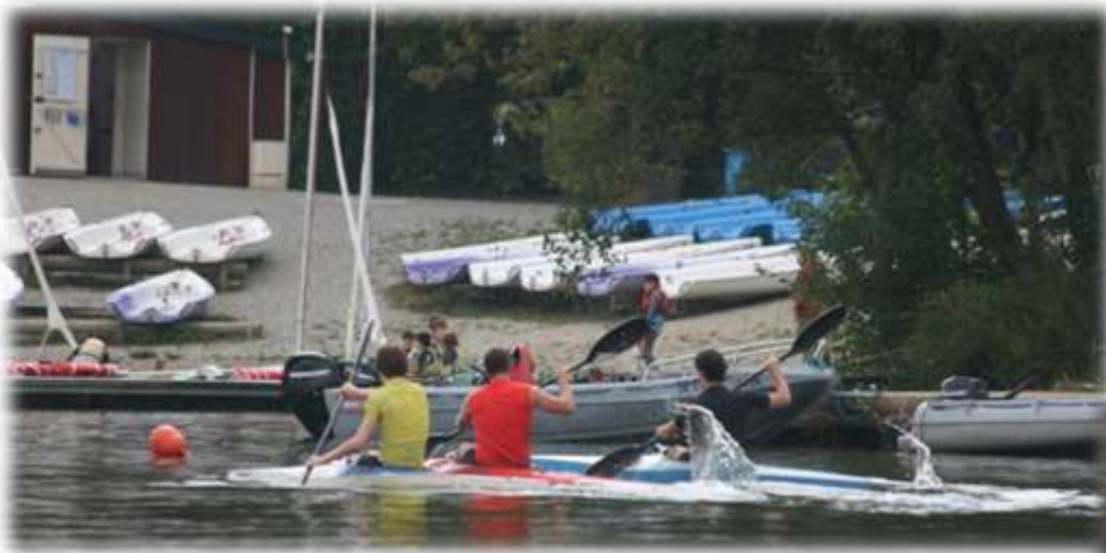
Water activities on the Erdre River (1km from Icam)